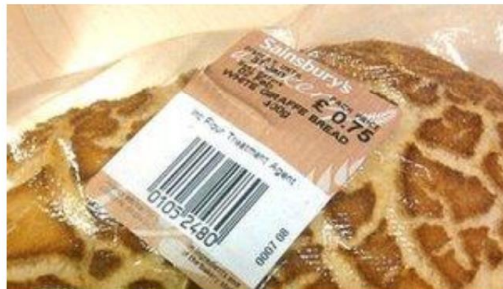
The newly-branded giraffe bread went on sale on Tuesday

She received a letter back saying that renaming it was "a brilliant idea".